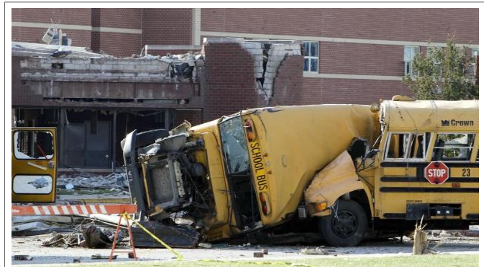
Wood County: School buses were tossed like toys during an EF4 tornado in Millbury, Ohio on June 5, 2010. Seven people were killed. Lake High School (pictured) was destroyed.